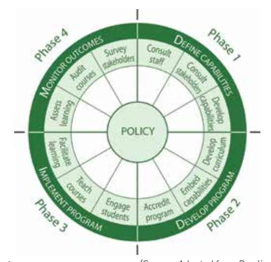
Figure 1: (Source: Adapted from Dowling, 2005) A graduate capability-driven curriculum design and delivery process

The DYD Stakeholder Consultation process can be used in Phase 1 of the cycle.